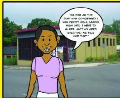
30-year old AA female Dust user.

"...I didn't know what to do like to get myself out of that situation...he was trying to get me to have sex with him in that car, and I didn't want to and I was getting scared because he was getting aggressive. So I was like I don't want to do it here, y'know, and I'm trying to think of ways to get out of there. So I said, Let's go to my house, y'know? And I was living at the corner...at this time, and there usually always be a lot of guys out there ...I just like got of the car, and I started crying because I was like so scared this dude was going to rape me ...those dudes just ran up to me to the car, and he pulled off cause he got scared. So that's how I got out of it. But like I couldn't, I couldn't like really see, I couldn't see like clear, everything was like a blur, and when like when I tried to step up on the curb, it like took me forever. I was so, I was too high."